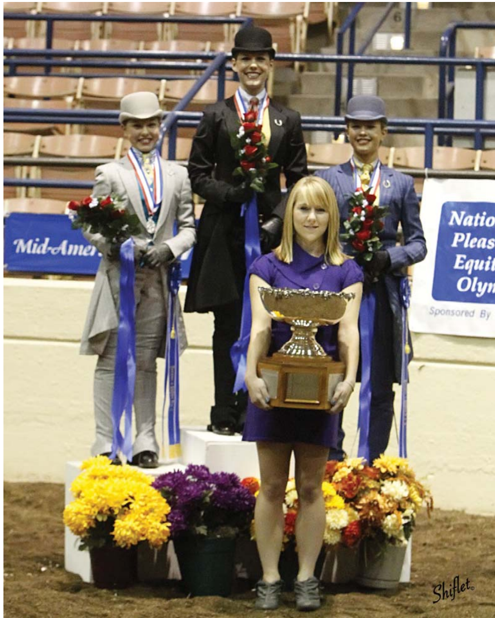
13 and Under 2010 Pleasure Equitation Olympic Winners