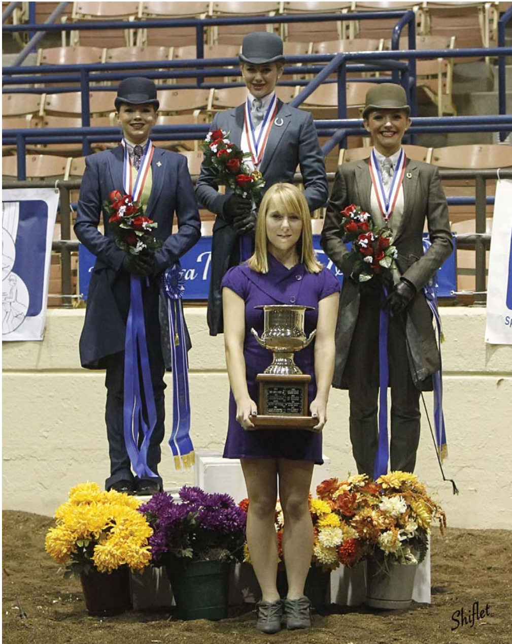
14-17 2010 Pleasure Equitation Olympic Winners